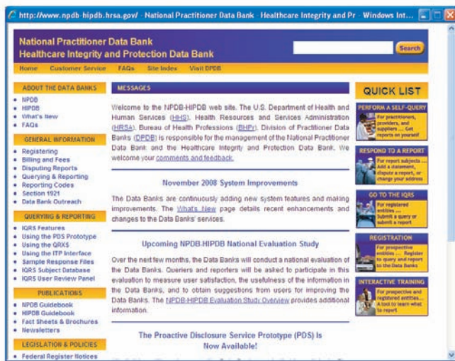
Figure 1. NPDB-HIPDB Home Page

If you are already a registered entity and wish to update your registration, you may do so using the Integrated Querying and Reporting Service (IQRS), available from the NPDB-HIPDB Web site.